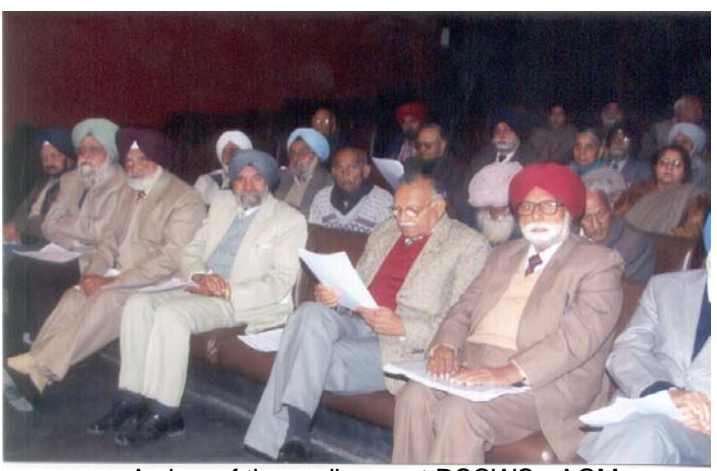
A view of the audience at RSCWS - AGM