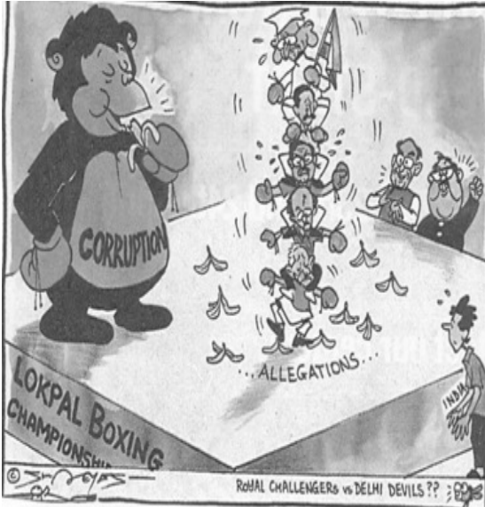
Cartoon courtesy : Hindustan Times, ND