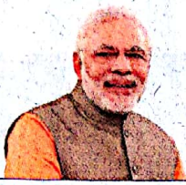
Narendra Modi Prime Minister