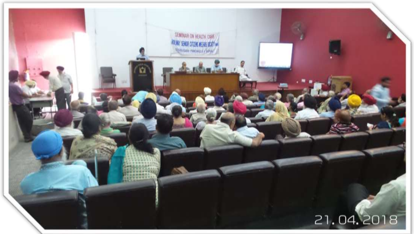
A GLIMPSE OF THE AUDIENCE AT THE AGM OF RSCWS ON 21 ST APRIL, 2018

These presentations were made during the Annual General Body Meeting of RSCWS held on 21 st April, 2018 at Govt. Museum & Art Gallery Auditorium, Sector-10, Chandigarh, which was attended by nearly 100 senior citizens of the Tri-city – Chandigarh, Panchkula & Mohali.