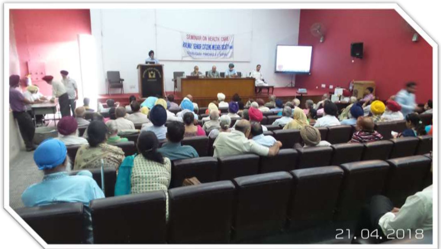
A GLIMPSE OF THE AUDIENCE AT THE AGM OF RSCWS ON 21 ST APRIL, 2018

These presentations were made during the Annual General Body Meeting of RSCWS held on 21 st April, 2018 at Govt. Museum & Art Gallery Auditorium, Sector-10, Chandigarh, which was attended by nearly 100 senior citizens of the Tri-city – Chandigarh, Panchkula & Mohali.