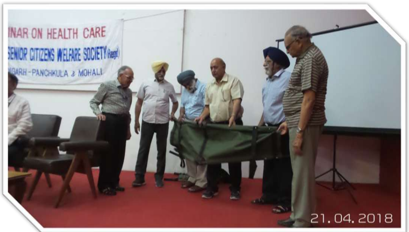
FOLDING STRETCHERS BEING PRESENTED BY RSCWS TO THE REPRESENTATIVES OF STATION SUPERINTENDENT CHANDIGARH DURING AGM OF RSCWS ON 21 ST APRIL, 2018

Railway Senior Citizens Welfare Society (RSCWS) Chandigarh, recently presented two folding stretchers to Railway Station Chandigarh to fast track carrying the injured persons in case of train accidents and other exigencies, as part of their social welfare activities. Earlier two Wheel Chairs were presented for the sick & the handicapped patients.