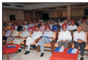
Audience at the GBM & Seminar on Heart Care by RSCWS at Chandigarh